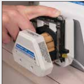
2. Easily snap cartridge into place on pump head.