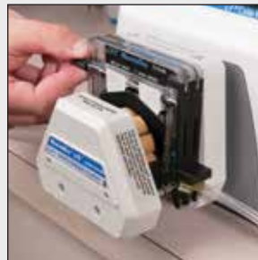
3. Adjust occlusion using index scale on cartridge.