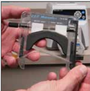
1. Select tubing, load cartridge, and set tubing retainers.