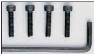
Mounting hardware and tool supplied with pump head