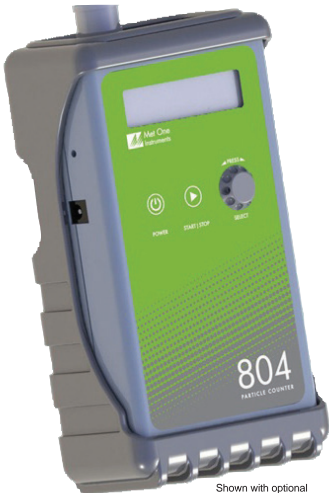
Shown with optional protective boot.

Stores up to 2500 records for output, Excel formatted output via included single computer software. USB interface provides quick data download and field firmware upgrades.