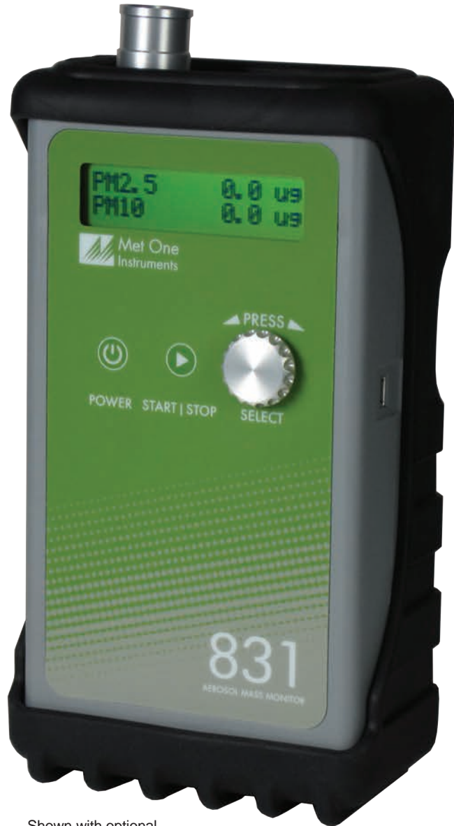
Shown with optional protective boot.

View sample history easily on the display or export data via the USB port using the included software. Unit stores up to 2500 sample events. USB interface provides quick data download and field firmware upgrades.